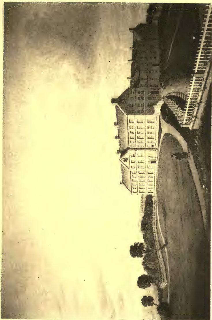
Wesleyan College in 1828.